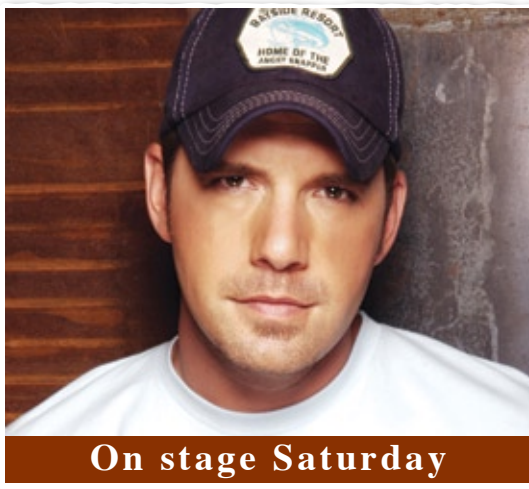
On stage Saturday

Ocoee's 15th Annual Founders' Day Festival is kicking off with a big bang this year. There will be music, food, games, fireworks, rides, historical exhibits, arts and crafts, classic cars, a fishing tournament and more. Founders' Day Festival will be held on Friday, October 17 and Saturday, October 18, at Bill Breeze Park, along the beautiful shores of Starke Lake. The highlight of the 2-day event is the FREE concerts on Friday and Saturday. This year's line up is impressive.