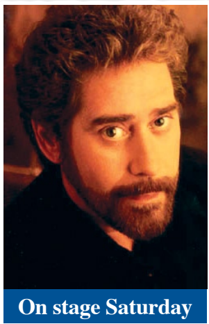
On stage Saturday

Earl Thomas Conley is a Grammy winner who has 18 No. 1 singles on the country music charts, including Fire & Smoke , Holding Her and Loving You , Once in a Blue Moon , and Love Out Loud . Earl became the first and only country artist ever to appear on the popular R&B television show "Soul Train," where he sang his 1986 hit duet with Anita Pointer of the Pointer Sisters, "Too Many Times."