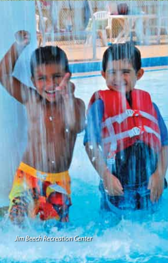
Jim Beech Recreation Center