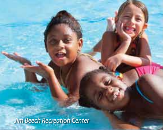
Jim Beech Recreation Center